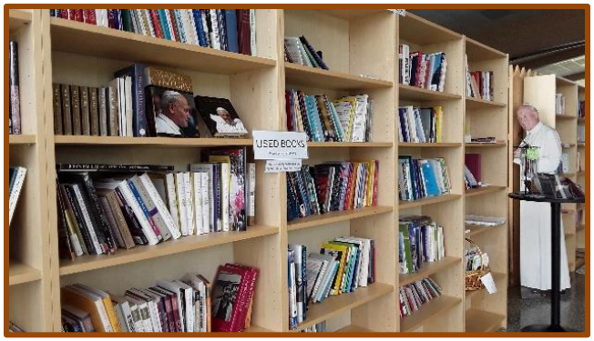
Thank you to all who stop in the Gift Shop and find treasures of our Catholic faith and souvenirs of the Auriesville Shrine. The Gift Shop is an important source of income, and this year of the coronavirus has scaled back pilgrimages and thus shopping. We appreciate your patronage!

(L) 1885 Chapel after the 2008 reconstruction.