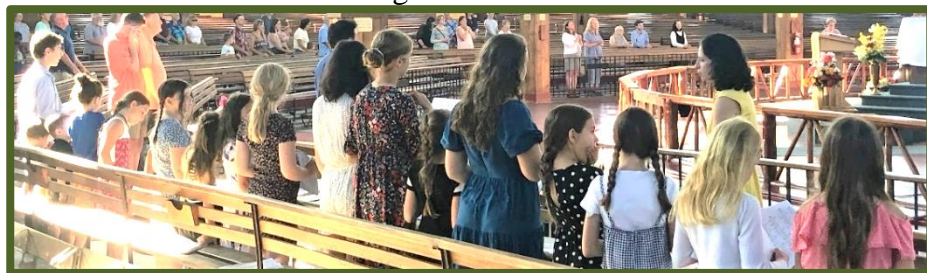
Kids Choir in Coliseum in 2022

RSVP to Grand Knight Eric Mazzone 518.487.9307