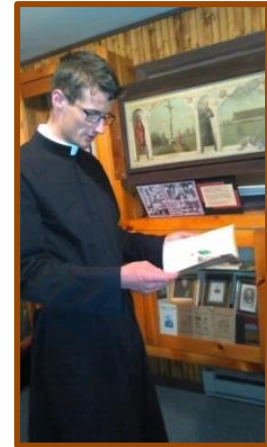
Jogues the St. habited enjoyed