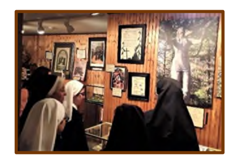
Sr of Parish Visitation of Mary Immaculate