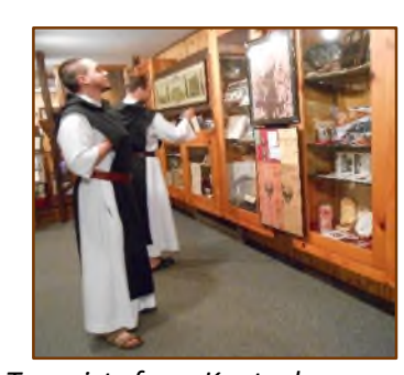
Trappists from Kentucky